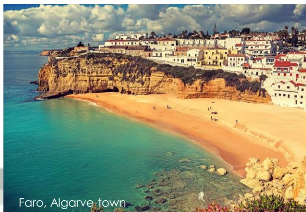
Faro, Algarve town