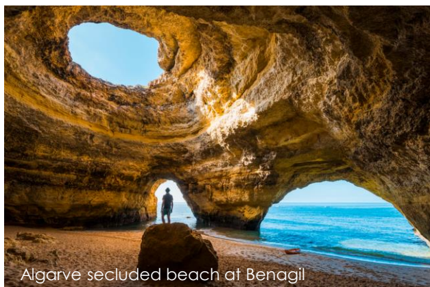
Algarve secluded beach at Benagil

The Algarve's natural beauty, pleasant climate, and diverse attractions make it a popular destination for tourists seeking relaxation, outdoor activities, and cultural experiences. Whether you're interested in lounging on the beach, exploring historical sites, or enjoying the local cuisine, the Algarve offers a little something for everyone.